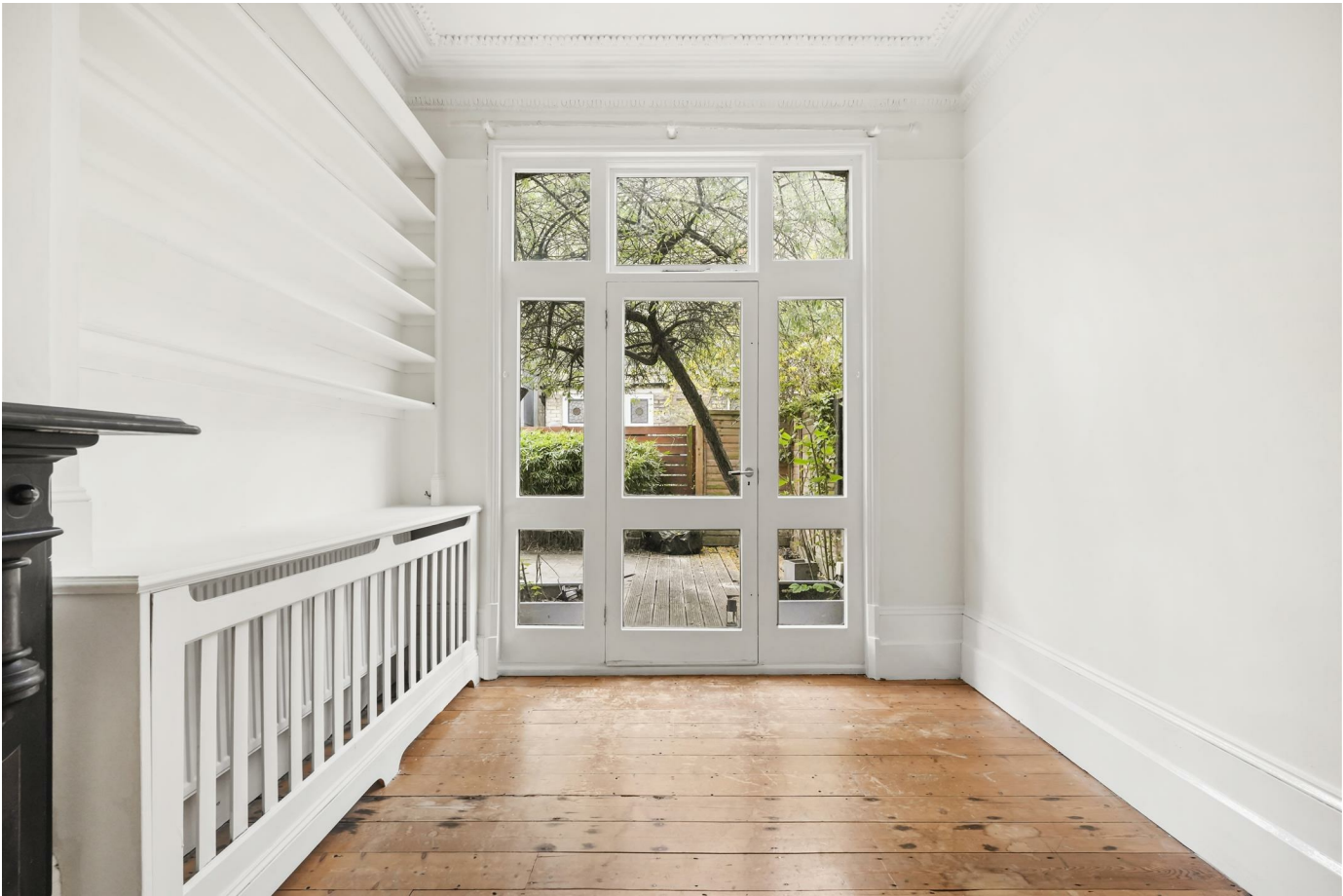
• Original Features