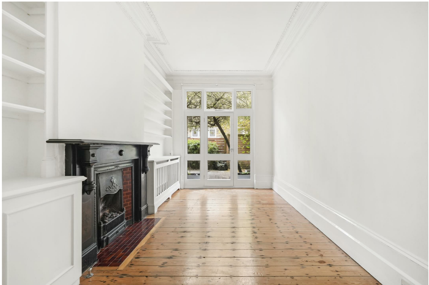
• Private Garden